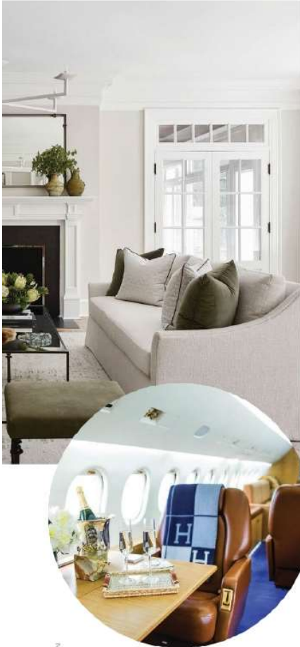
JET PHOTO COURTESY OF SOAR MAGAZINE AND JET LINA AVIATION